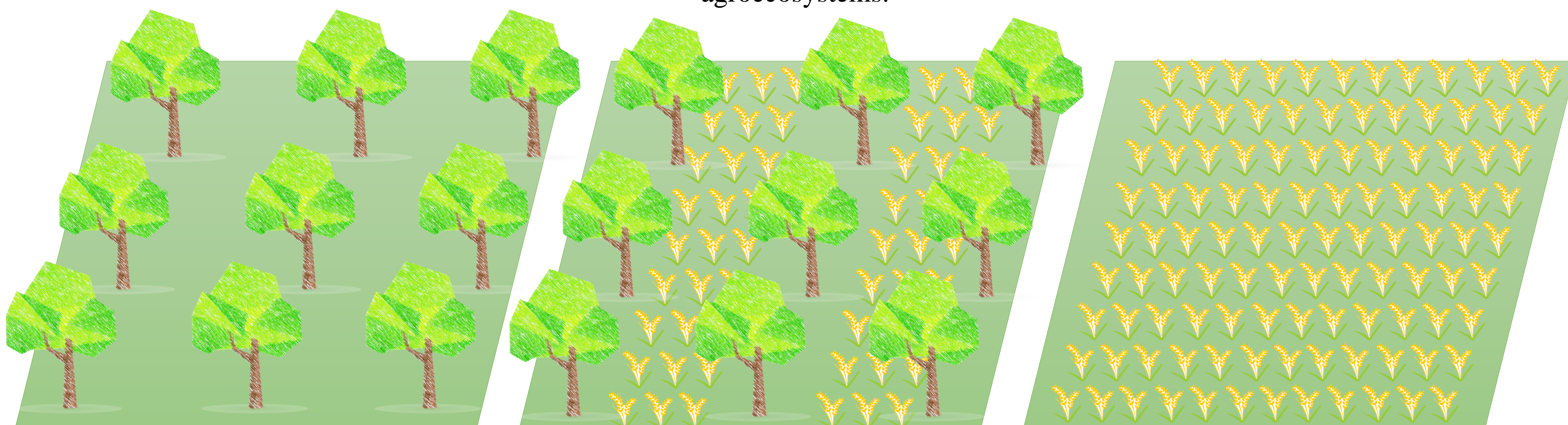
permanent walnut orchard

Therefore, wheat yield is an additional source of profit. It is necessary to carry out further economic analysis to determine the viability of such agroecosystems.